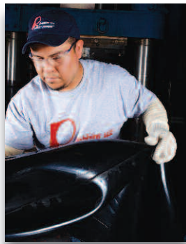
Robbins envelopes are fully inspected before packaging and delivery.