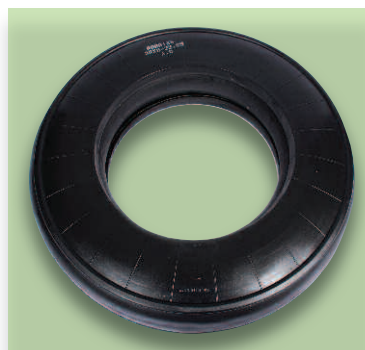
Redesigned Inner-Lope with improved bead and seams to insure durability and a great seal cure after cure