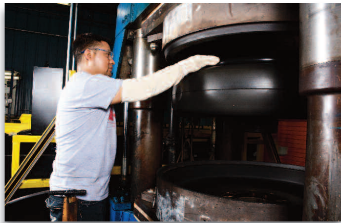
A Robbins operator loading the mold using advanced Compression Molding Technology.