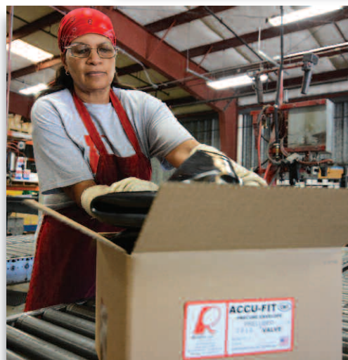
The inspection and packaging department at Robbins ensures retreading product quality before delivery. Put our envelopes and curing tubes to the test.