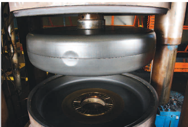
CMT mold ready for loading and envelope curing.