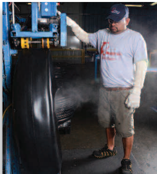
Factory lubrication extends envelope life.