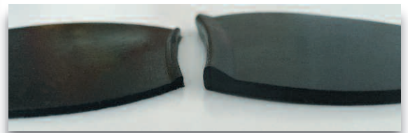
New envelope design has a 43% thicker skirt and a larger, tapered bead, while maintaining elasticity.