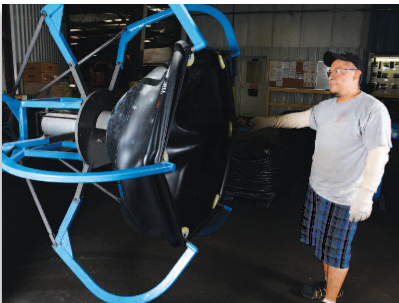
Hot-tear testing of envelopes right after molding as part of our stringent quality standards.

We also turn to HEXPOL to mix and formulate rubber compounds that we provide to our customers for their own mold cure or precure retread processing operations. Quality compounding from Robbins helps increase durability, extend mileage, and resist wear, so you can provide your customers with retread tires that perform like new ones.