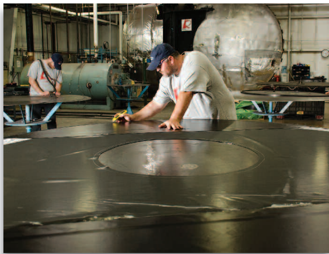
Compression Molding Technology (CMT) from Robbins uses proprietary rubber compounds that are placed into a mold for curing, which eliminates splicing the envelope, increasing production life.